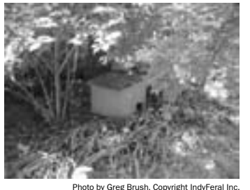
In cold weather, shelter is actually more important for stray and feral cats than food. These insulated shelters provide protection from wind and water, even in harsh climates.