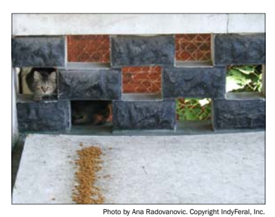
Mama cautiously approaches her feeding site.

"TNR through IndyFeral is a good program because it works to humane-ly and effectively reduce the feral cat population. It doesn't cost the taxpayers anything. Considering cutbacks in public services, IndyFeral has worked out a great program that doesn't cost the city